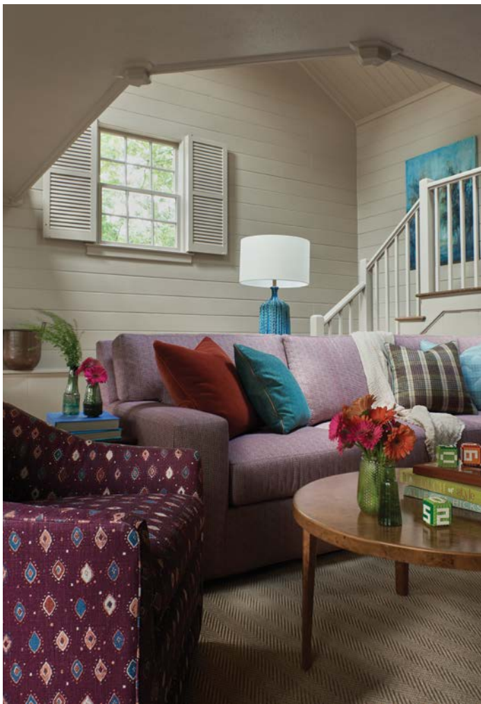
BOTTOM: The family of five gathers in the family room for TV time and relaxing. The sectional by Century Cornerstone is from A. Hoke Ltd. Applegate added the antique coffee table and comfy chair by TCS Designs, Inc. swathed in a durable but sophisticated Peter Dunham fabric.

In the living room, she took a similar approach by incorporating two stunning traditional settees, which were the inspiration for the rest of the room's design. Now the homeowners can entertain seamlessly outside of the family room and kitchen. New Osborne & Little draperies coupled with the Benjamin Moore Melted Ice Cream paint injected color into the once-neutral space. "Now the room feels completely different; much more colorful and bright," Applegate says. "Between the two, the husband and wife had some really great family pieces, photos, and artwork, all a reflection of their lives, their families, and their personalities."