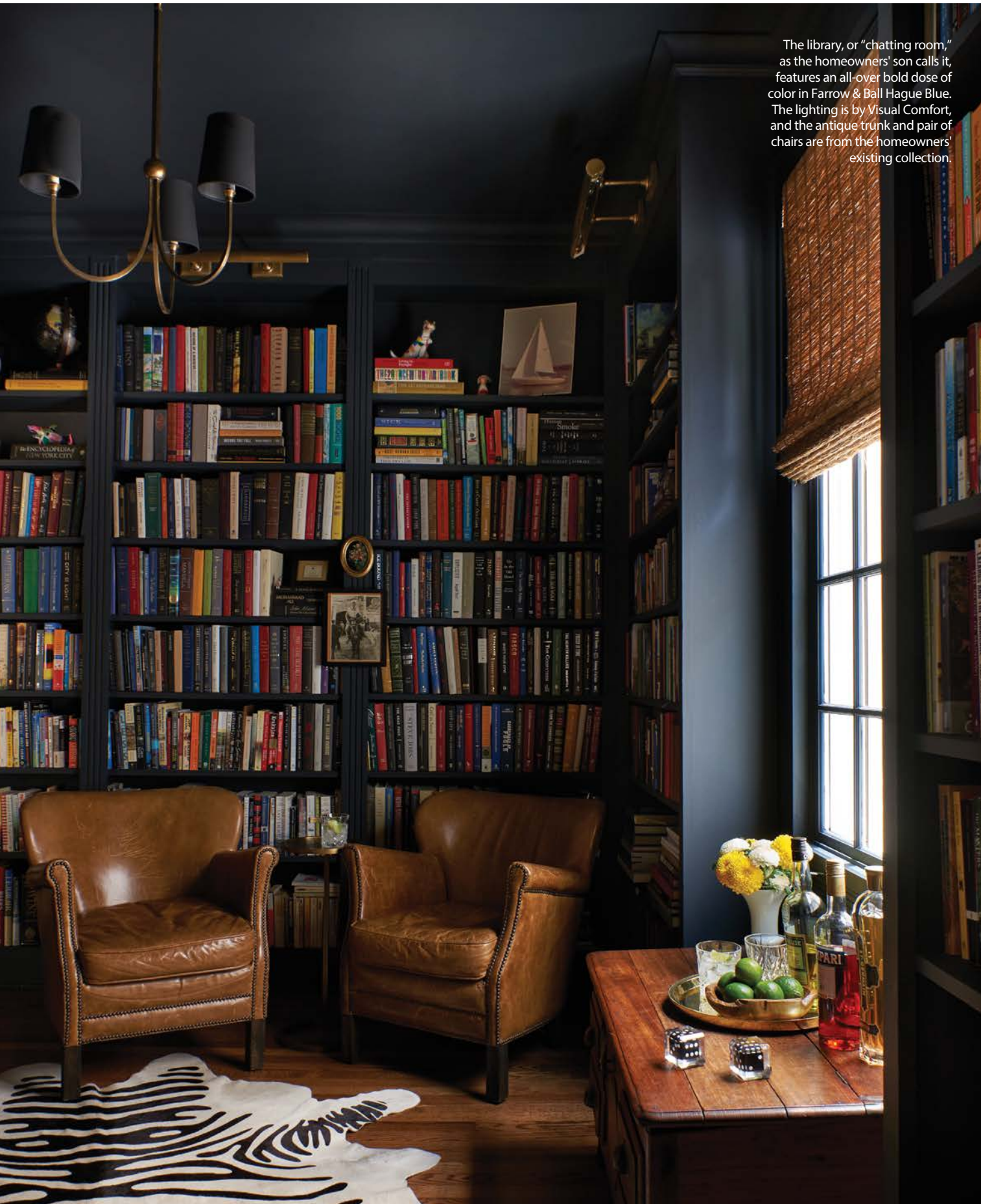
The library, or "chatting room," as the homeowners' son calls it, features an all-over bold dose of color in Farrow & Ball Hague Blue. The lighting is by Visual Comfort, and the antique trunk and pair of chairs are from the homeowners' existing collection.